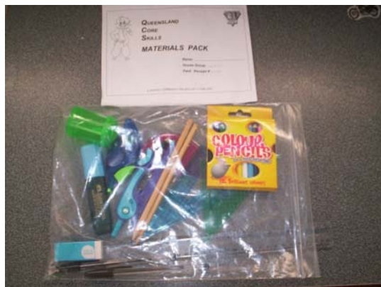
Sample of the QCS Materials Pack